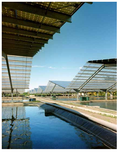
The first and second generation of 'Agrinergie', and the 'Aquanergie' solution covering fish farms.